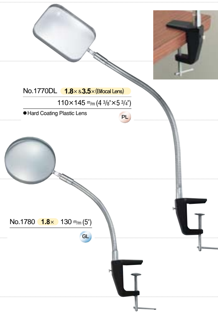
No.1770DL 1.8x & 3.5x (Bifocal Lens) 110x145 mm (4 3/8" x 5 3/4") ● Hard Coating Plastic Lens

When you want to focus on especially small objects, you can see them with the extra lens situated in the bottom lens. Since the lens has a hard coating, the lens is not easily damaged.