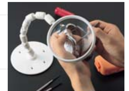
No.1720PS 2x & 4x (Bifocal Lens) 100 mm (4") ● inner box : 5pcs ● Color : ivory · black [Neck length h : 23cm (9")] ● Hard Coating Plastic Lens