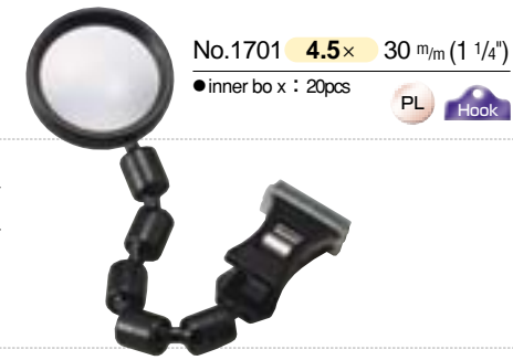
No.1701 4.5x 30 mm (1 1/4") ● inner box : 20pcs