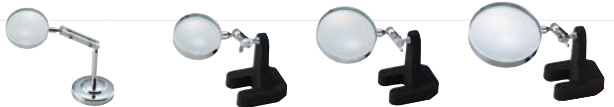
No.1600 3.5x 45 mm (1 3/4") ● inner box : 6pcs