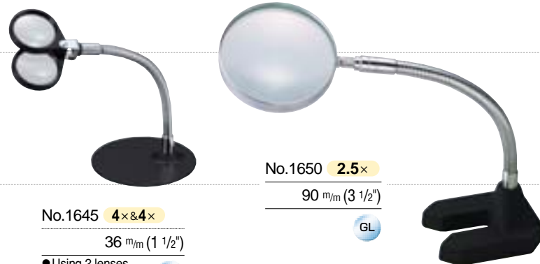
No.1645 4x & 4x 36 mm (1 1/2") ● Using 2 lenses together provides 7x magnification.