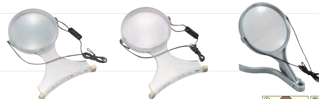
No.6500 2x 100 mm (4") ● inner box : 12pcs