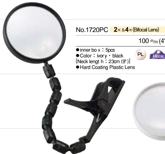
No.1720PC 2x & 4x (Bifocal Lens) 100 mm (4") ● inner box : 5pcs ● Color : ivory · black [Neck length h : 23cm (9")] ● Hard Coating Plastic Lens